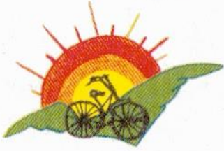
Collective Ecology and Peace, Spain