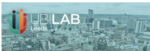
UBI Lab Leeds, United Kingdom