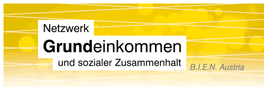
Network Basic Income and Social Cohesion – B.I.E.N. Austria