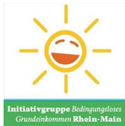
Initiative Group Unconditional Basic Income Rhein-Main, Germany