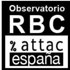
Basic Income Observatory, Attac Spain