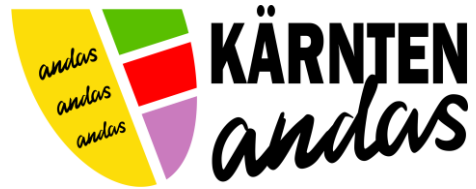
Kärnten andas, Austria