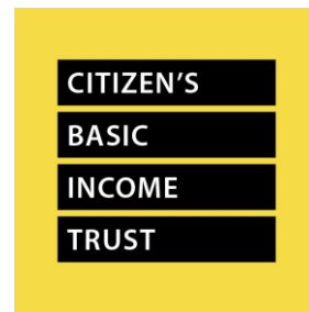
Citizen's Basic Income Trust, United Kingdom